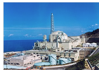
Monju in 2007