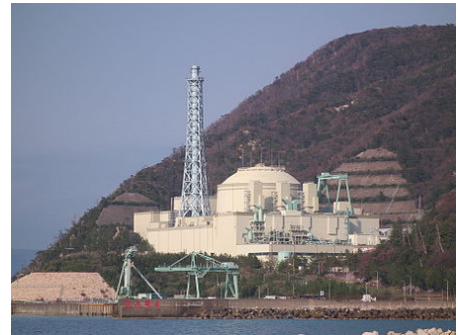
Monju Nuclear Power Plant